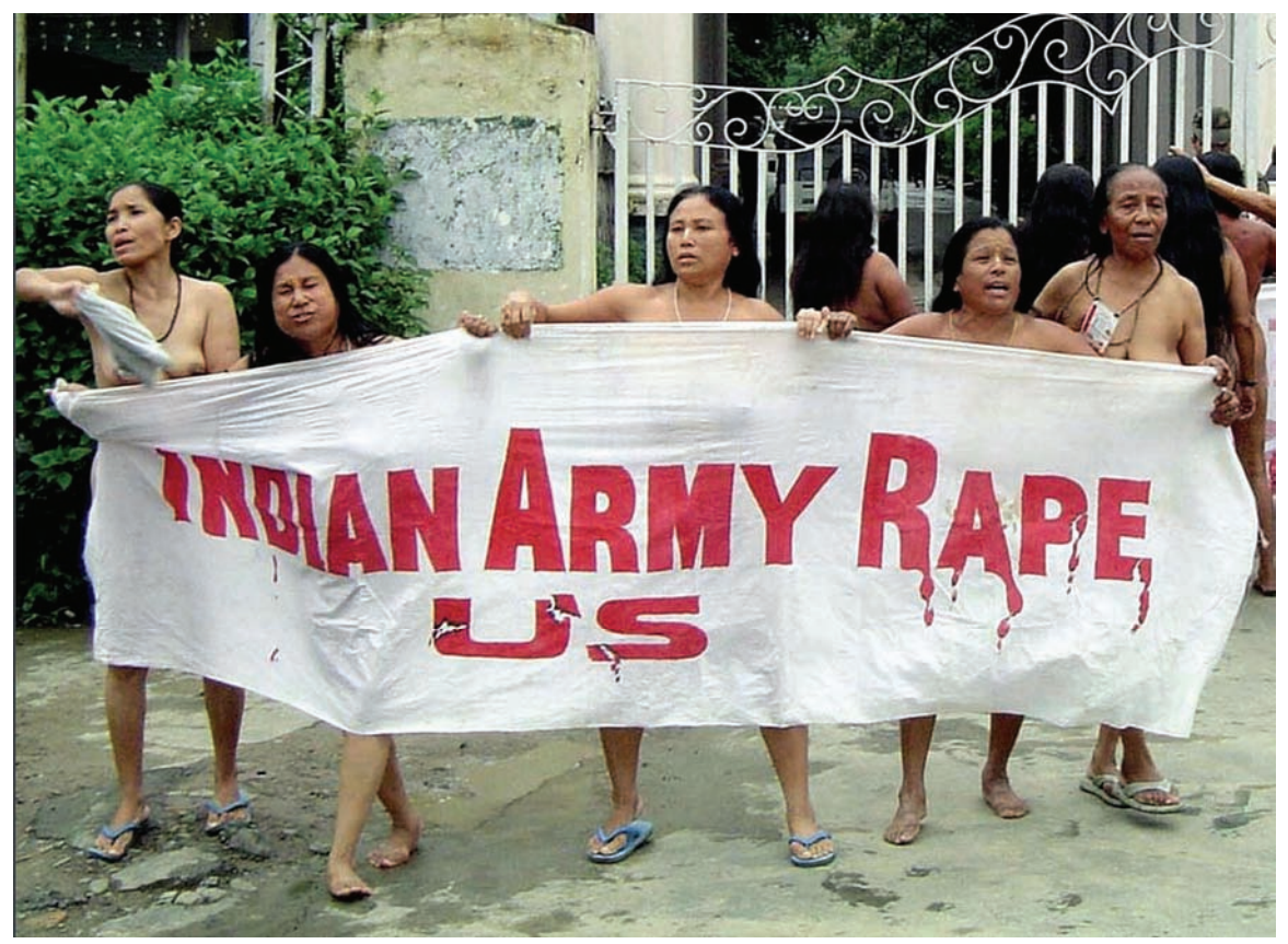
Women protest the killing and alleged rape of Thangjam Manorama Devi with a banner reading "Indian Army Rape Us" at the army headquarters in Imphal in July 2004.

Indian Prime Minister Manmohan Singh meanwhile promised justice in the Manorama case and a review of the AFSPA. In November 2004, he set up a committee headed by B.P. Jeevan Reddy, a retired judge of the Supreme Court. The report was submitted in June 2005. While the Jeevan Reddy committee report has also not been made public, the contents were leaked, and it is now known that the committee recommended repeal of the AFSPA. The report however remains with the cabinet in New Delhi for consideration, and no action has been taken.