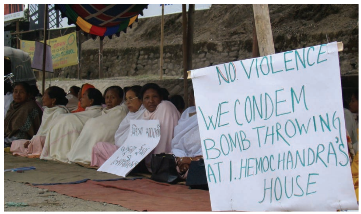
Protest against attack by militants in Imphal, the capital of Manipur.

Manipuris complain most about militant groups' culture of extortion. The state is unable to provide protection from these extortion demands—in fact, many government officials pay themselves. Recently, there has been a spate of abductions by militant groups to recruit children into armed groups involved in fighting. At least 24 school children were reported missing in June and July 2008, leading to widespread protests. One faction of the militant group People's Revolutionary Party of Kangleipak (PREPAK) admitted that that they had recruited some of the missing children.